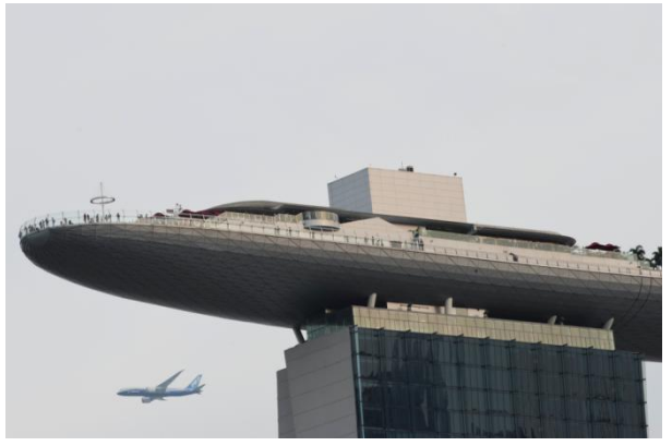
Boeing 787 Dreamliner cruises by Sands SkyPark

This special viewing is made possible by Boeing's 787 Dream Tour, which is making two stops in Asia this month to showcase the game-changing technologies of the new plane.